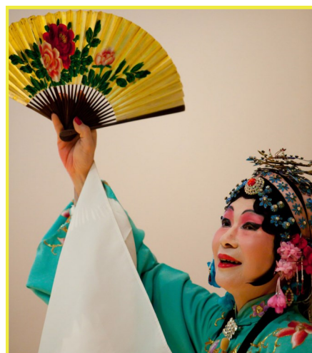
Not to be exchanged for Spring

The fascination of Kunqu for me is the unfathomable 'perfection' that the music and the performer can reach together. It is as liberating as it is rigorously disciplined. For the actor, the strictly executed stylised voice and movements are in fact the opposite of being restrictive. They free the actor from the strictures of everyday realism, whether in real life or on the stage. The actor is free to explore and deliver the essence of complex human feelings and predicaments.