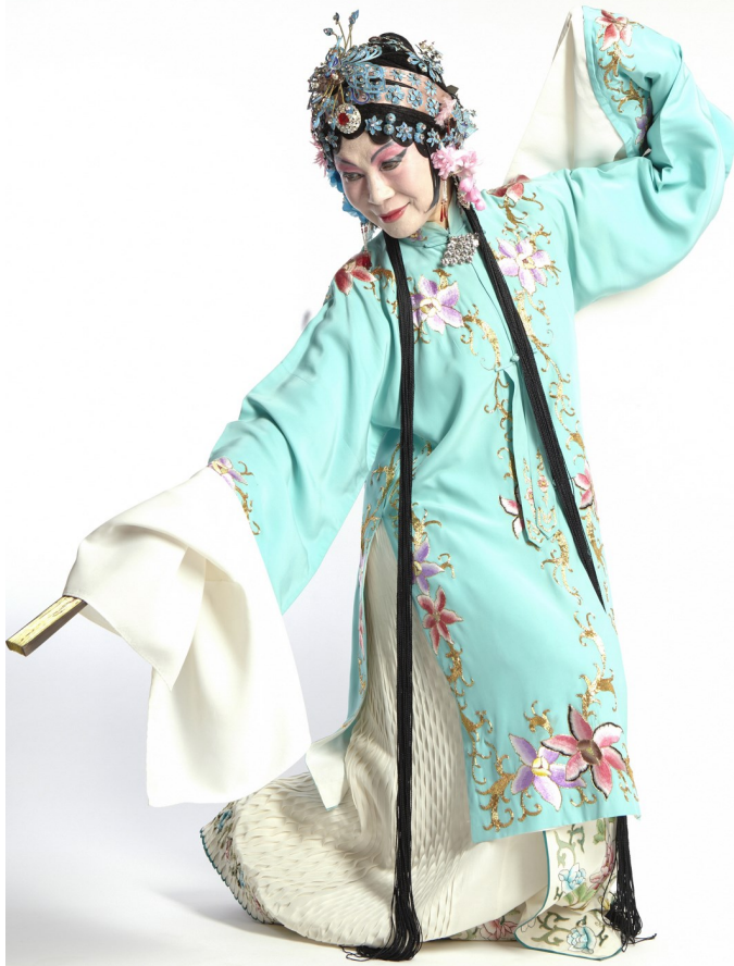
'In Pursuit of the Dream' from 'The Peony Pavillion'

Thank you for giving me opportunities in the past few years to come to you to talk about Peking Opera and Kunqu Opera. I am performing a 23-minute piece of Kunqu Opera with musicians on Friday 14th November at 18.00-21.00 hrs at The British Museum in conjunction with their Ming Dynasty exhibition. This is fitting as Kunqu rose to its height in the Ming Dynasty, and was popular with the court, the literati and the rising merchant class looking for refined entertainment. This show is free to the public and I hope that some of you will come and share my passion for this exquisite art form.